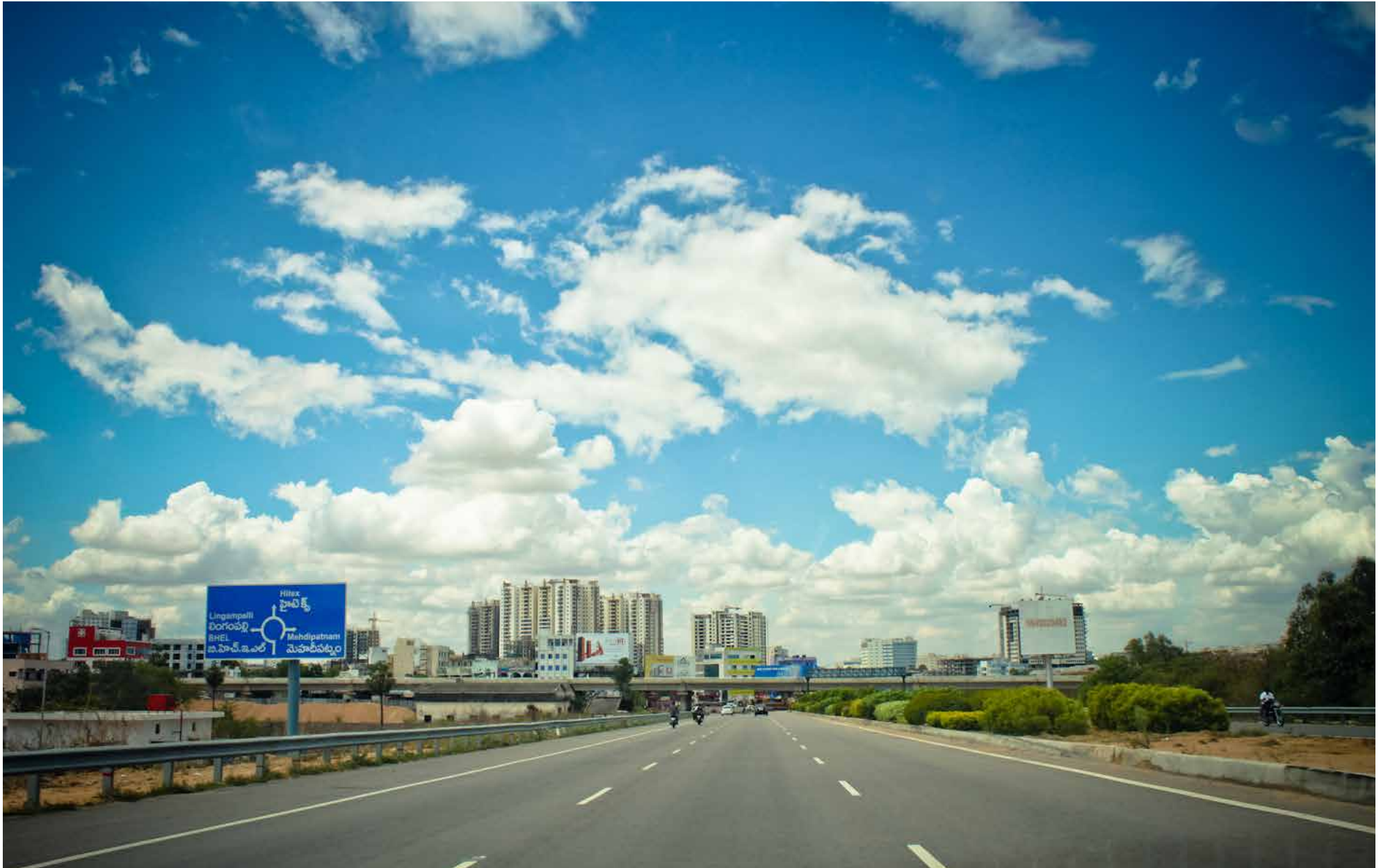
Photos of the Hi-tech City and shopping malls

Photo source: https://www.flickr.com/photos/abhiomkar/6718775877