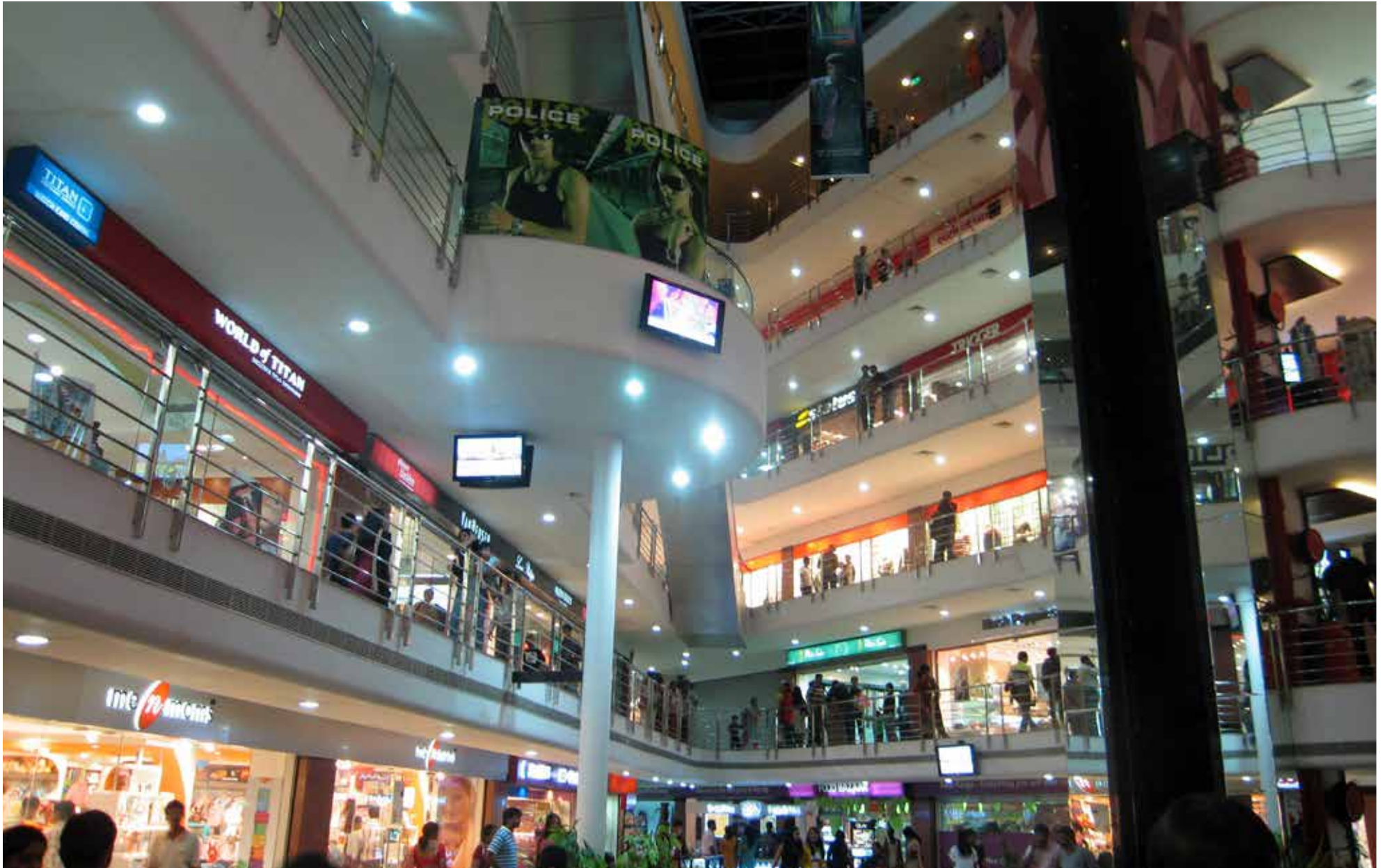
Photos of the Hi-tech City and shopping malls

Photo source: https://www.flickr.com/photos/kalyan3/2079888937