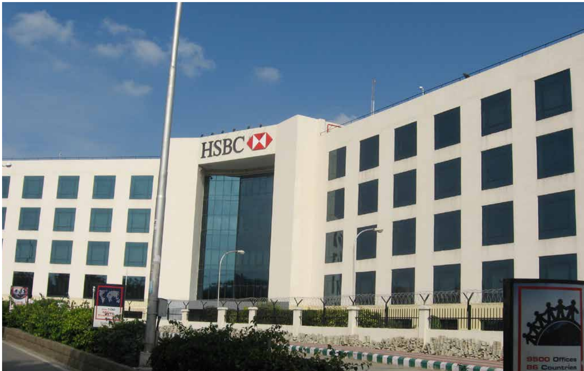
Photos of the Hi-tech City and shopping malls