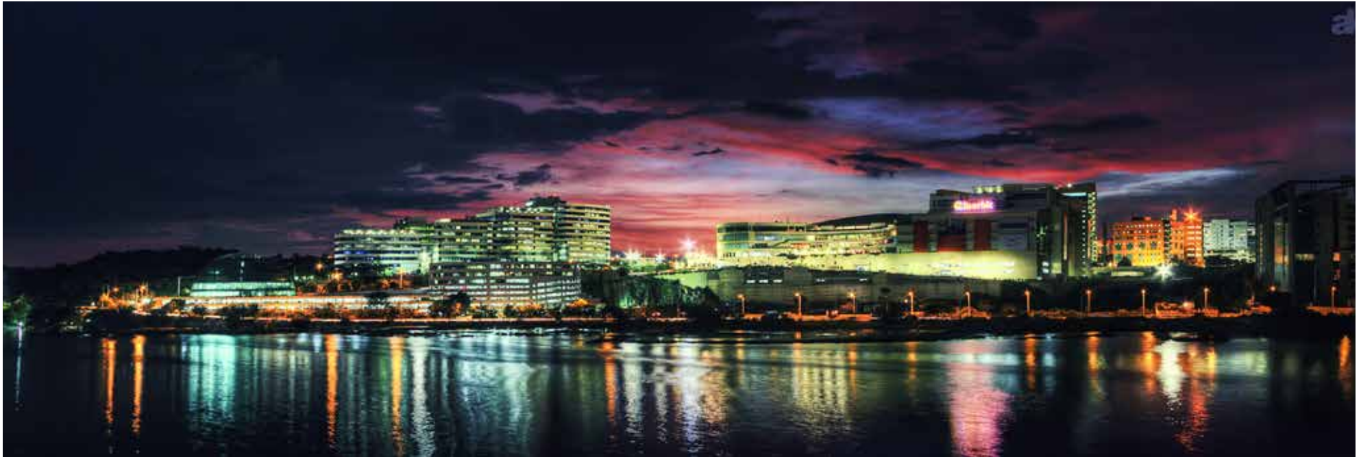
Photos of the Hi-tech City and shopping malls

Photo source: https://www.flickr.com/photos/adityakolli/5654448428