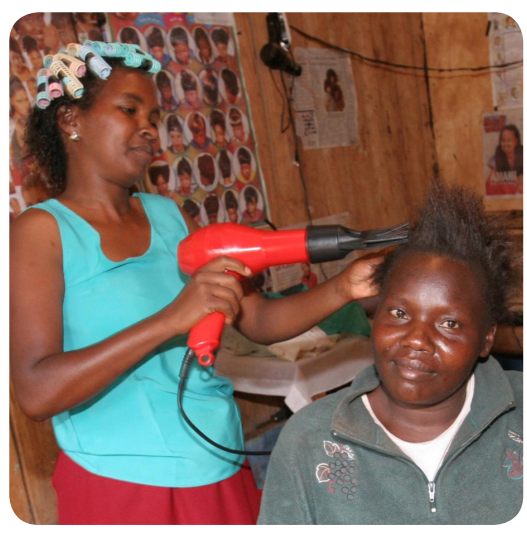
Woman in Kenya running a hairdressing business