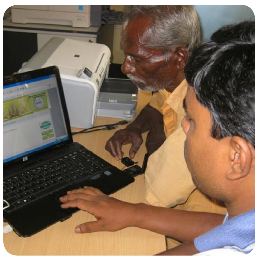
Farmer in Bangladesh finding information on the internet