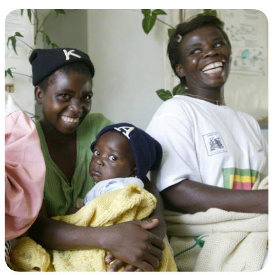
New mothers in a health centre in Kenya receiving advice and medication