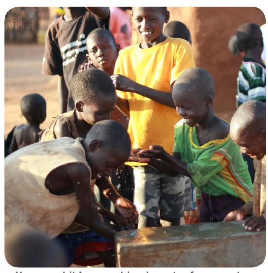
Kenyan children washing in water from a solar powered water pump