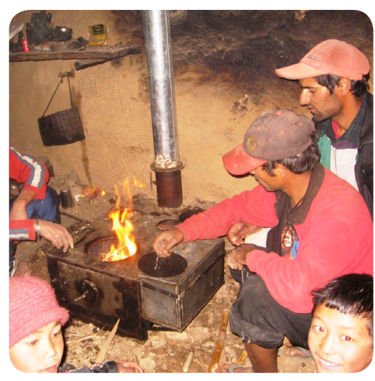
Nepalese family using a stove for warmth as well as to cook food