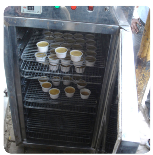
Curd machine used to make yoghurt in Bangladesh