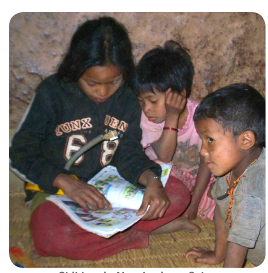
Children in Nepal using a Solar lantern to read at night