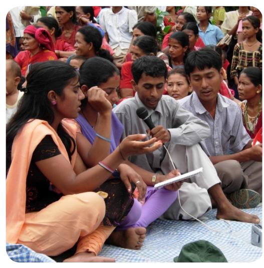
Business men and women at a meeting with farmers in Bangladesh