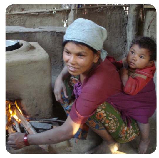
Mother in Peru cooking food on an outdoor stove