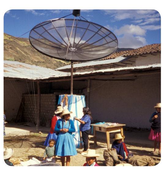
Solar powered satellite dish in Peru