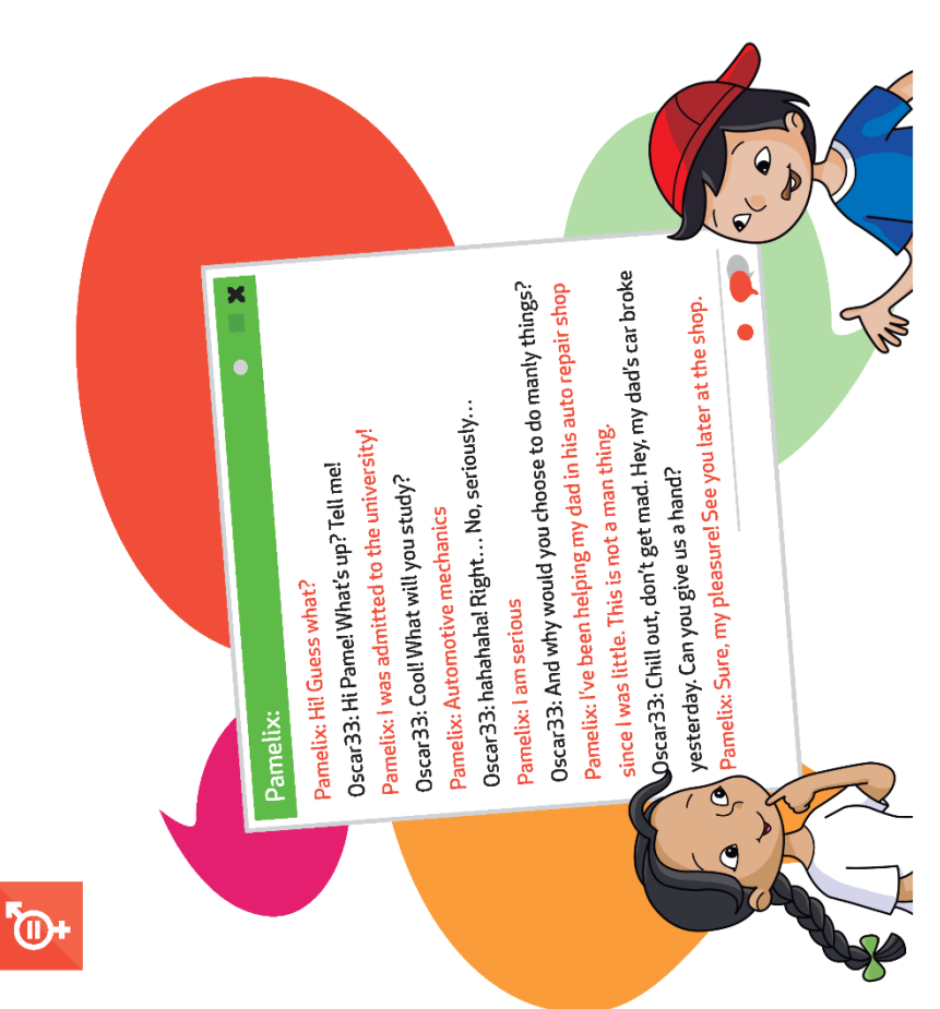
Why is it important for girls and boys to be able to do the same things?